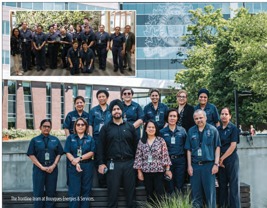
The frontline team at Bouygues Energies & Services.